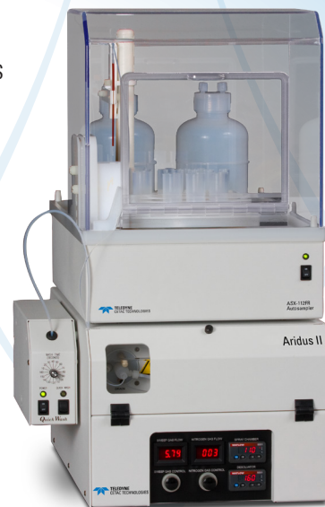
ASX-112FR with Aridus II

The ASX-112FR is designed to stack directly atop the Teledyne CETAC Aridus II Desolvating Nebulizer to further conserve laboratory space.