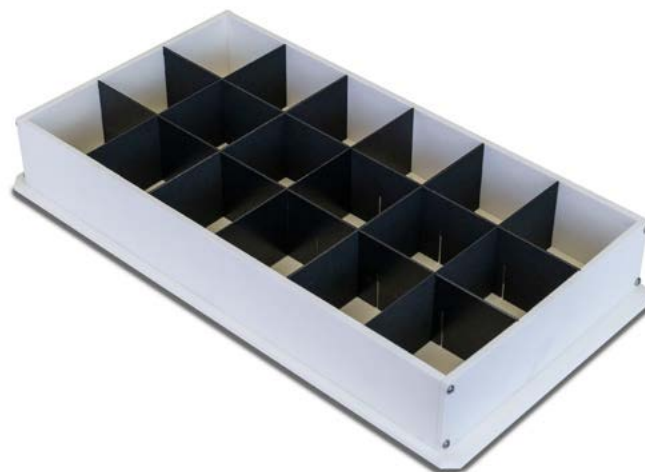
18/21 Position Adjustable Rack 32-0748-047