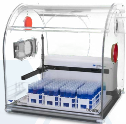
ENC-560 DC enclosure shown with ASX-560 (not included)

An optional clean enclosure guards against environmental impurities to protect both operator and equipment.