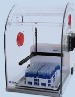
ENC-560 DC Enclosure for ASX-560: ENC-99-0010