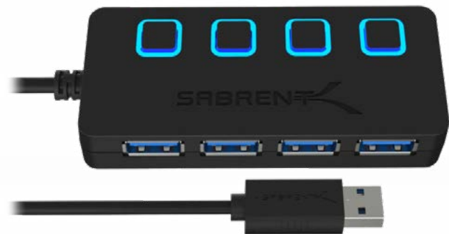
Switching USB Hub for SimPrep: SP7672

Using the built-in functionality of the ASX-560 autosampler, this USB hub lets you quickly change modes with the SimPrep system.