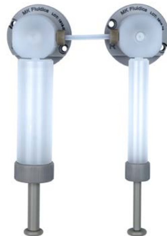
SimPrep PFA Kit: 32-0923-044

For ultra-clean applications, there is the option to exchange the valves and syringes for this set made with PFA, PCTFE, and PEEK. These high purity materials help to ensure the best performance when working with high purity samples. Kit includes left and right valves, a 10 mL syringe, and a 1.0 mL syringe.