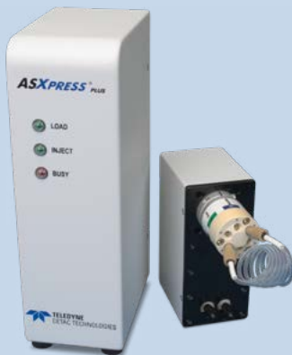
ASXPRESS PLUS Upgrade: XPU-99-0021