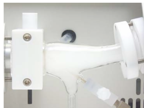
Nebulization of 1% HNO 3

After the condenser, the dried aerosol particles are swept by the nebulizer gas to the ICP instrument for analysis.