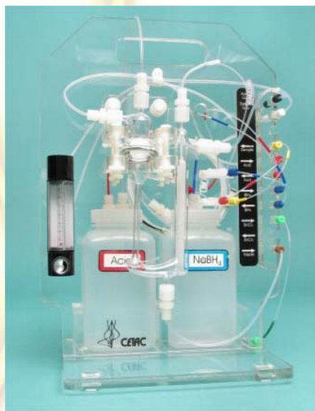
Figure 1. CETAC HGX-200 Hydride Generator