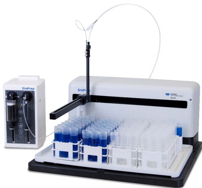
SimPrep Liquid Handling Station