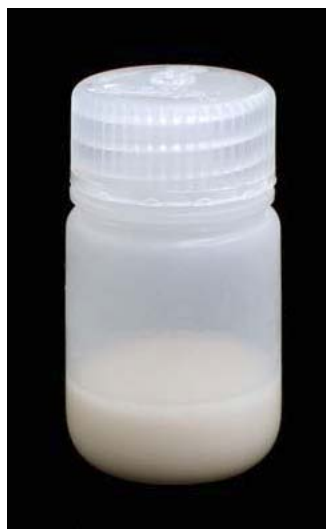
10% w/v SPR-IDA

A 15-mL sample of the CASS-4 seawater was added directly to the 15-mL mark of a pre-cleaned 15-mL volume polypropylene centrifuge tube (Corning, Corning NY). A 100 \mu L aliquot of a 10% suspension of SPR-IDA reagent beads was then pipetted directly into the sample. The tube was covered with parafilm and the contents well mixed.