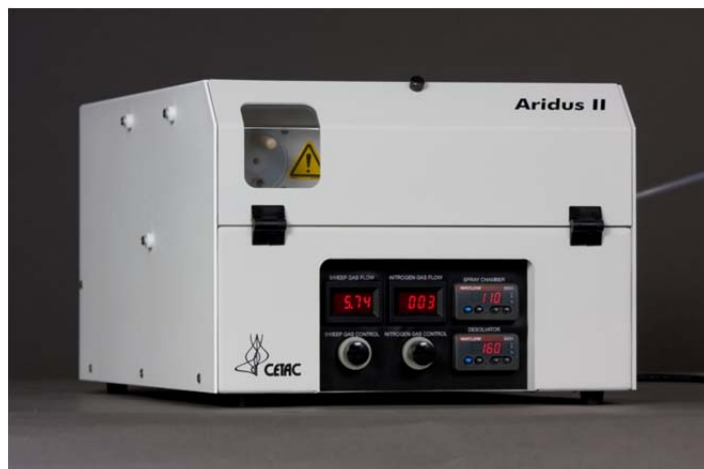
Teledyne CETAC AridusII Desolvating Nebulizer System

Rare earth elements are critically important components of modern electronics (ex. magnets, lasers, cellular phones, computers) and iridium and platinum are widely used as chemical catalysts. Figures of merit for a conventional nebulizer/spray chamber and the inert desolvating nebulizer system will include operating conditions, interference intensities and reduction factors, background equivalent concentrations (BECs), instrument detection limits (IDLs), and limits of quantitation (LOQs).