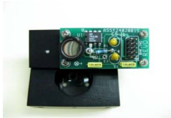
EOFM/Focal lens assembly