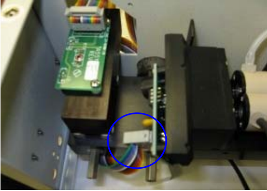
Ribbon cable orientation