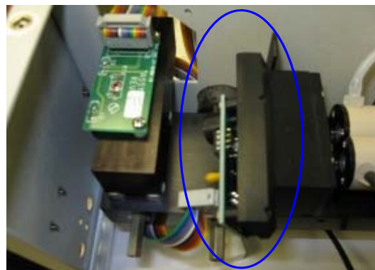
EOFM board on mount