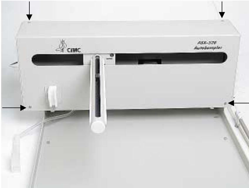
Figure 1-7. Front view of ASX-520 Autosampler showing front cover screws.