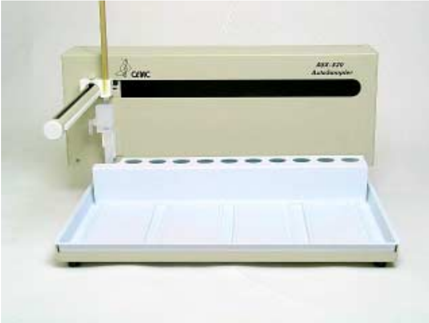
Figure 1-1. Front view of ASX-520 Autosampler.