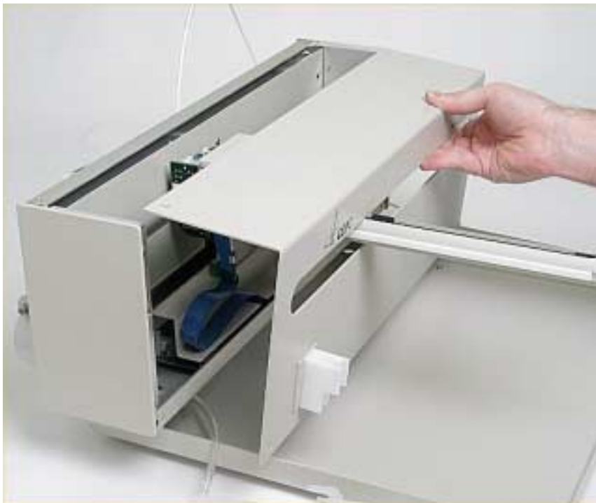
Figure 1-8. View of ASX-520 Autosampler with the front cover being removed.