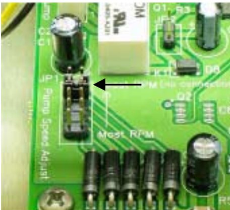
Figure 1-12. View of main board left hand corner.