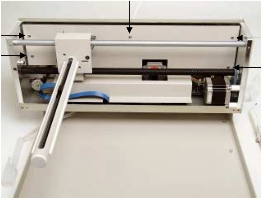
Figure 1-9. View of inner shield inside the ASX-520 Autosampler.