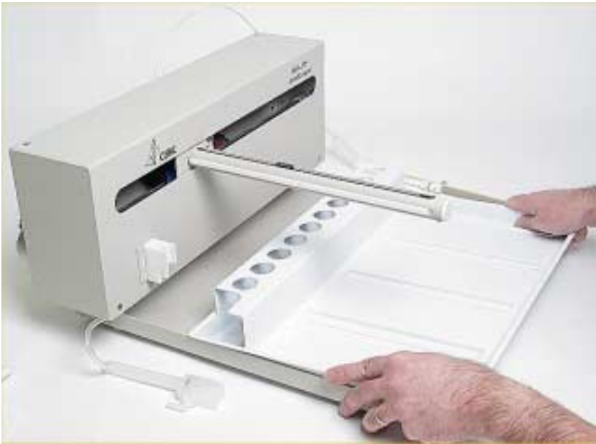
Figure 1-6. Removing the tray.

5. The autosampler tray should then be removed. Lift up the tray and pull out (Figure 1-6).