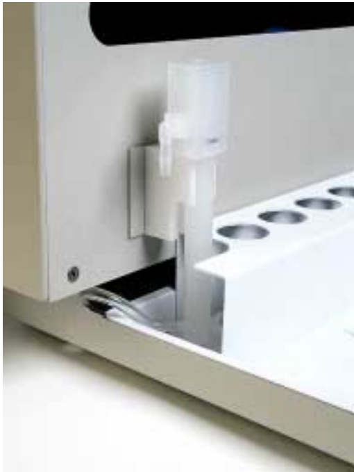
Figure 1-4. View of rinse station.