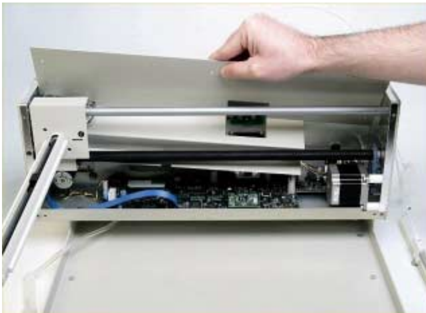
Figure 1-10. Removal of inner shield.