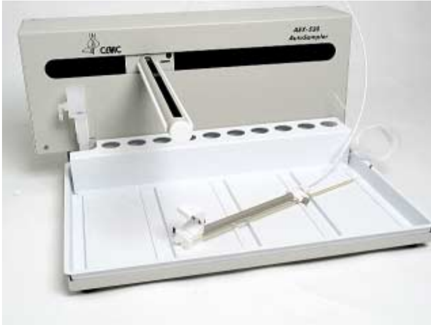
Figure 1-3. Z-drive removed from arm assembly.