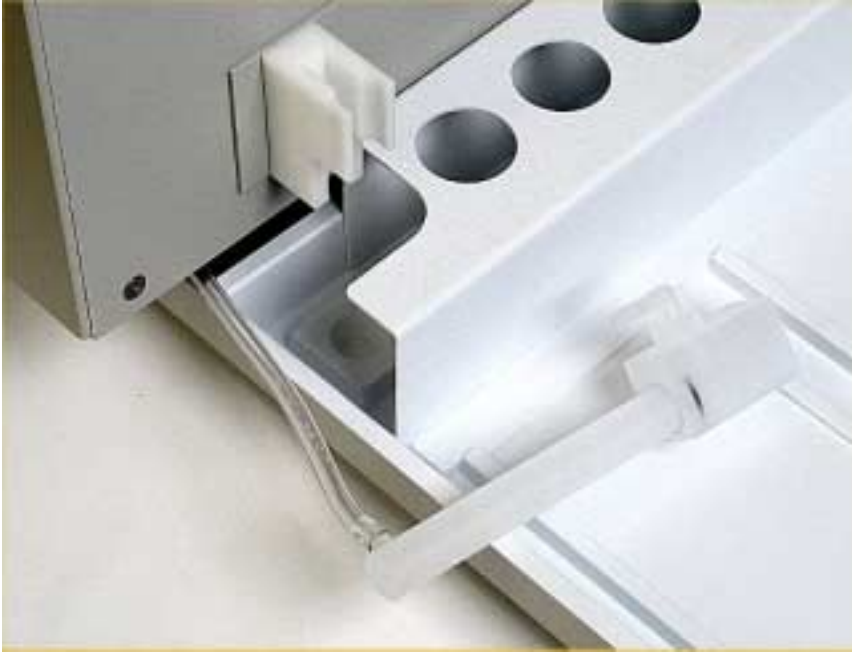
Figure 1-5. View of rinse station removed from the front cover.

5. The autosampler tray should then be removed. Lift up the tray and pull out (Figure 1-6).