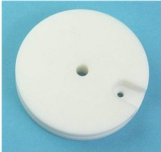
Z-axis rotor disc assembly