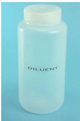
Diluent bottle (1 L)