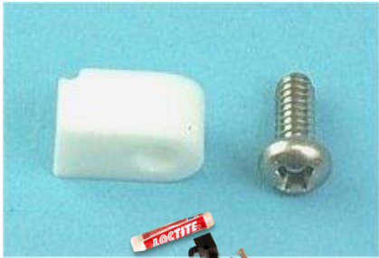
Z-Axis Rotor Clamp and Screw Kit