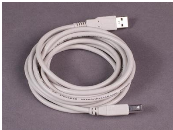
USB Cable (3 Meters)