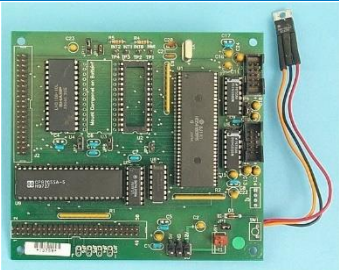
Main processor board (includes firmware)