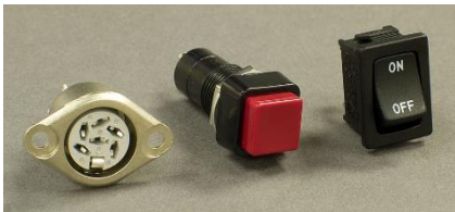
Switch / Power input kit (6 pin input)