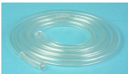
Diluent uptake tubing (Tygon®)