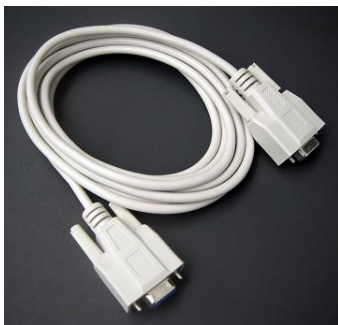
Serial cable (Female/Female)