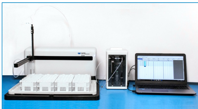
Figure 1: SimPrep Automated Liquid Handling Station

The SimPrep Automated Liquid Handling Station combines proven and tested technologies for an overall increase in laboratory efficiency. By combining the known and trusted Hamilton ML600 with intuitive software and the robust and reliable Teledyne CETAC Autosampler our customers are able to fully automate their sample preparation. This new product improves the accuracy and reproducibility of sample prep by eliminating time consuming hand pipetting.